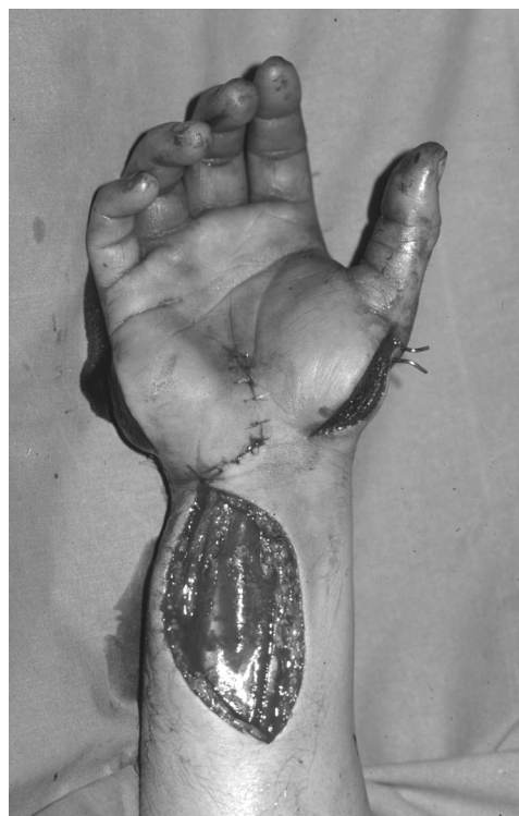
FIG. 3. In patient 5, generalized hand compartment plus acute carpal tunnel plus distal forearm compartment (sublimis compartment). Note the muscles bulging through the thenar and hypothenar incisions and the impossibility of closing the distal forearm incision.

In three patients the distal volar forearm was found to be tense on palpation. In two patients, measurements taken at the distal and proximal volar forearm levels yielded pathologic values distally (average, 60) and normal values 39 proximally (average, 18). All had concomitant acute carpal tunnel syndrome, and after opening the carpal canal, further release of the distal antebrachial fascia was performed in an attempt to decompress a hypothetical distal forearm compartment. Muscle, mainly flexor carpi ulnaris and adjacent flexor superficialis, bulged through the incision, making primary closure impossible (Fig. 3). The fascia of the pronator quadratus 40,41 was also released, but the muscle was found to be normal. Reservations may arise as to the existence of the compartment referred to above, because there is no close space at this level. However, other "open" compartments, such as the carpal tunnel, 35-38 have been described in the literature and found consistently in experiments. 42 The syndrome may in fact be a form termed by Gardner as "sublimis syndrome." 43 Rather than