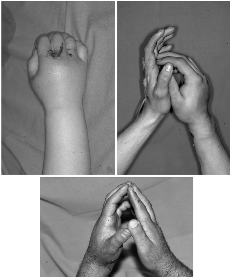
FIG. 2. Poor correlation among hand swelling, intrinsic minus posture, and intracompartmental pressures can be seen in these examples. (Above, left) Severe swelling, intrinsic minus posture, and intracompartmental pressure of 13 mmHg. (Above, right) Severe swelling, intrinsic plus position, and intracompartmental pressure of 66 mmHg (case 10). (Below) Printer roller injury: severe swelling, mild intrinsic minus stance, and intracompartmental pressure of 15 mmHg.

Spinner et al. 11 further stated, "The hand is usually grossly edematous. . . in the intrinsic minus posture." The intrinsic minus stance has been considered diagnostic of acute hand com-